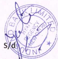
Authorised Officer IndusInd Bank Limited